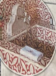
Enticing: Left and below, Christian Louboutin's hotel. Far left, the view of Serifos island in Greece from its castle