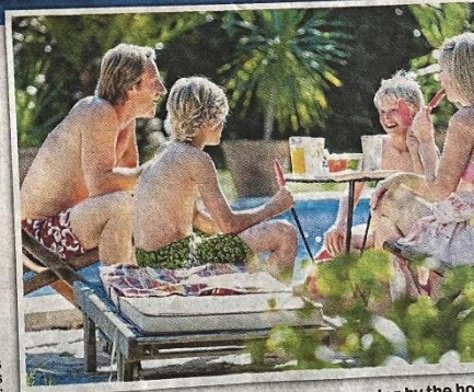
Family fun: Dalaman in Turkey and, Inset, lounging by the hot